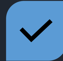
EVALUATION MATRIX-BASIC ELEMENTS OF TOOLS